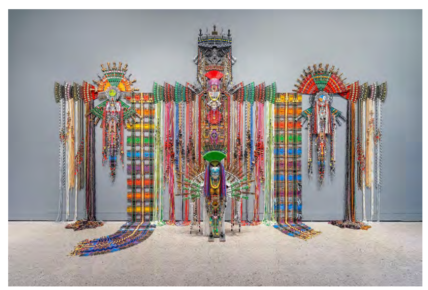
November 14 - December 21, 2024 Tues-Sat, 11-6 pm

Anne Samat's work is informed by the textile traditions of Malaysia, particularly those of the Iban people of Sarawak, the largest of Malaysia's 13 states. Combining items that we are familiar with from our homes, gardens, and surroundings, the traditional method of weaving gives way to a unique approach; instead of using thread as weft, we see rattan sticks (palm stems); instead of using a resist dye to color the thread, Samat threads together strands of yarn to create a single, completely new and original strand, which she likens to the act of a painter mixing colors on a palette.